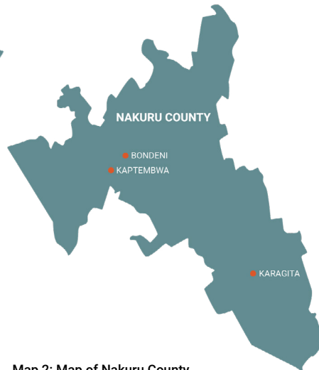
Map 2: Map of Nakuru County

The company Geointel was contracted to conduct the quantitative survey together with MIDRIFT staff. Geointel trained MIDRIFT enumerators ahead of the data collection. Systematic random sampling was used for the survey with 411 respondents participating from the three informal settlements. The enumerators started at the boarder of each village, then moved anti-clockwise, counting five houses, and knocked on the sixth house. If the respondents met the age criteria of being above the age of 18 (the legal age in Kenya) and consented to participate, the enumerator commenced with the survey. In cases where community members declined participation, did not meet the selection criteria, or there was no one answering the door, the enumerator proceeded to the next house.