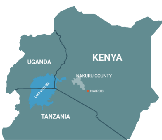
Map 1: Map of Kenya